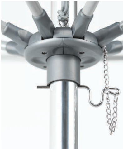
POLISHED SILVER ANODIZED ALUMINUM FINISH