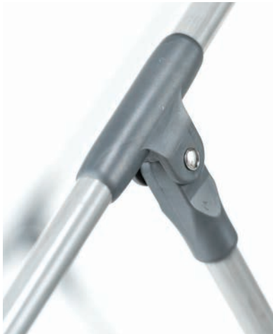
HIGH IMPACT POLYMER JOINTS AND .75" FIBERGLASS RIBS