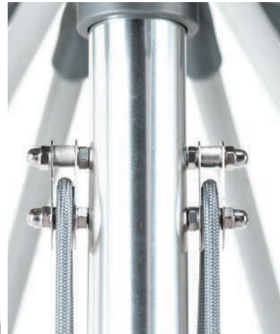
COMMERCIAL DOUBLE PULLEY SYSTEM