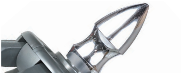
Optional: VERTEX FINIAL