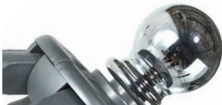
Standard: CLASSIC BALL FINIAL