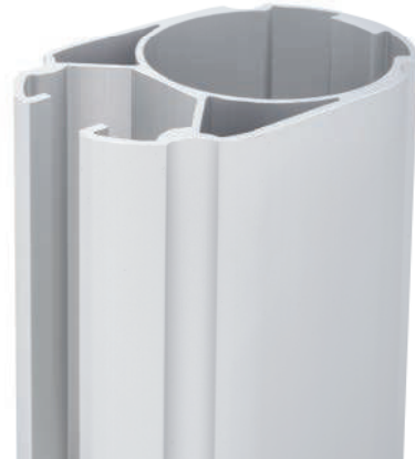
EXTRUDED ALUMINUM MAST