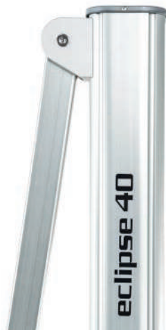
EXTRUDED ALUMINUM ON ALL CRITICAL JOINTS