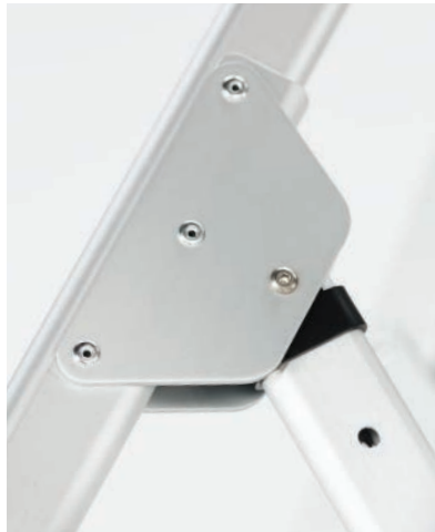
DOUBLE REINFORCED JOINTS