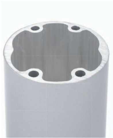
EXTRUDED ALUMINUM MAST