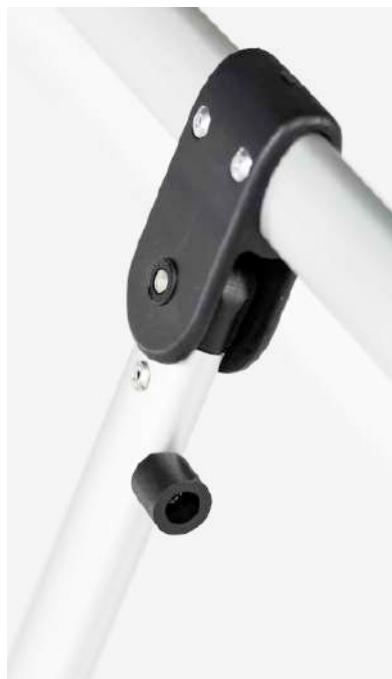
HIGH IMPACT RESIN JOINTS