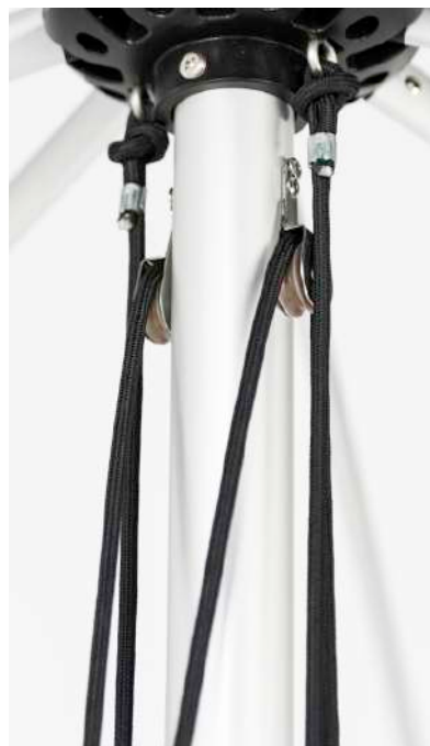
COMMERCIAL DOUBLE PULLEY SYSTEM