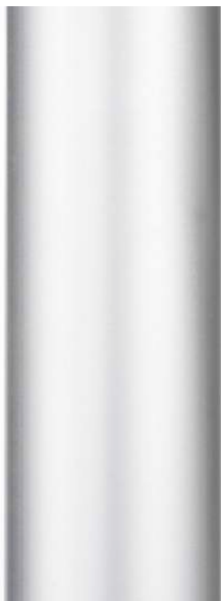
2" DIAMETER POLE

Stainless steel bolts and reinforced grommets secure the canopy and prevent fabric tearing. A commercial grade easy gliding double pulley and pin system (not push up), marine grade corrosion resistant aluminum frame with stainless steel hardware, and a modular construction add to the resilience of this already superior umbrella.